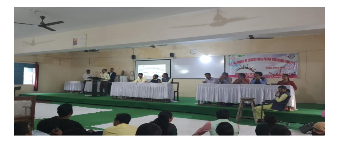
नहीं है" 1 M.Ed. Students as well as the B.Ed. students of Patna Training College participated in this competition.

The last literary event was the Quiz Competition organized on the premises of the Department of Education on 16.02.2022. The Students of B.Ed. and M.Ed. courses participated in this competition.